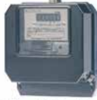
3 Phase 4 Wire (40 - 100 A)