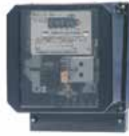
3 Phase 4 Wire (5 A)