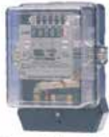
1 Phase 2 Wire (20 - 80 A)