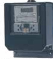
3 Phase 4 Wire (80 - 160 A)