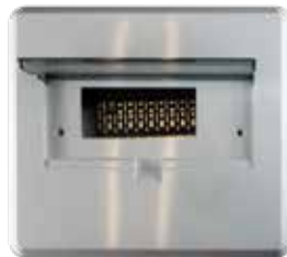
12-Way Flush Mounted

* Note: Other variations on request, including a CFL (energy saver) version bulkhead