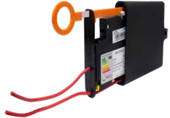
MCB not included - order separately