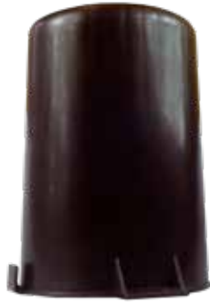
Plastic Pole Mounting Box