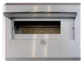
20-Way Flush Mounted